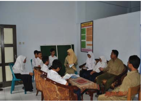
Class Room Environment and Activities